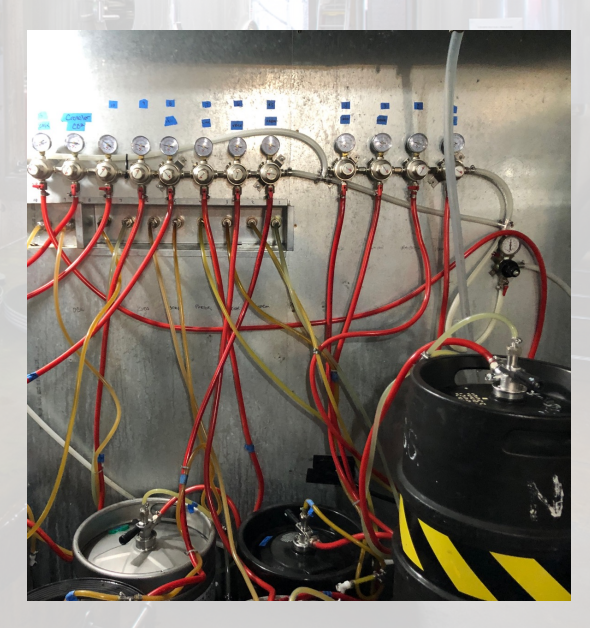
Coldroom Keg Lines