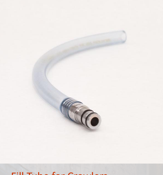
Fill Tube for Crowlers