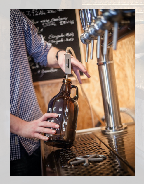
Beergun for Growlers